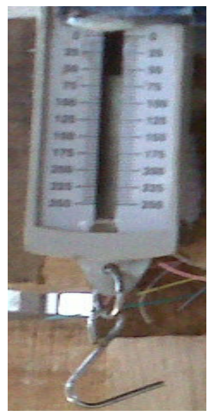
Fig 1. A snring weighing machine

Based on this we can build a simple table representing the numbers 0 to 10 in binary. We will keep the table side by side with the digital encoder representation of the binary numbers