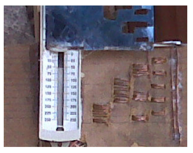
Fig. 4: A complete reverse engineered spring weighing balance.

The parallel printer port is made up of three ports, namely: the control port, the data port and the statues port. Each of these three ports has an address in decimal. The address of the status port is 889. This is the address with which we will read in the weighed value through the digital encoder into the computer. The following pins makes up the 5 input lines (pin 10, 11, 12, 13, 15) in the printer port. They are