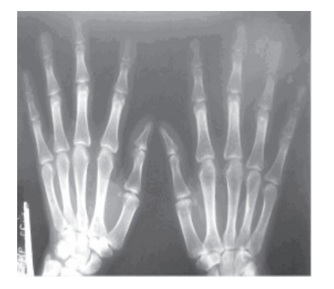
Figure 2: X-ray of the hands showing peri-articular osteopenia.