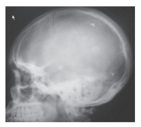
Figure 3: X-ray of the skull showing pepper pot appearance.

Serum calcium was greater than 2.55 mmol/L in 7.4% of the patients, ranged between 2.25 and 2.55 mmol/L in 33.3% and there was hypocalcaemia in 59.3%. In contrast there was hyperphosphataemia in 75% of the patients while the remaining 25% had serum phosphate less than 1.5mmol/L There was elevated calcium phosphate product (>4.55 \text{ mmol}^2/\text{L}^2) in 12.5% of the patients. Serum intact PTH was assessed in 14 patients, values were normal in 24%. ranged between 6 and 15 pmol/L in 18%, and between 16 and 30 pmol/L in another 40% of the patients. It was moderately elevated (31-90 pmol/L) in 18% of the patients. Osteocalcin levels were assessed in 17 patients, it was less than 50pmol/L in 70%, ranged between 50 and 100pmol/L in 12% and was above 100pmol/L in 18% of the patients. Also serum active Vit D3 assessment results revealed low level (<60pmol/L) in 83% of the patients while the remaining patients had higher values.