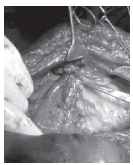
Fig. 2: Herniated Loops of Bowel