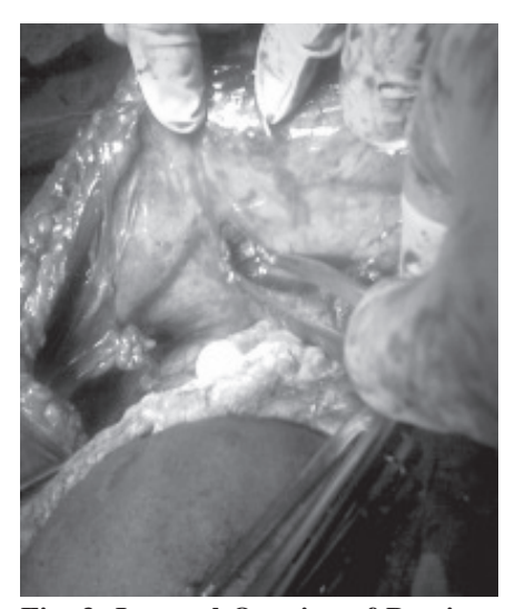
Fig. 3: Internal Opening of Previous Drain Site