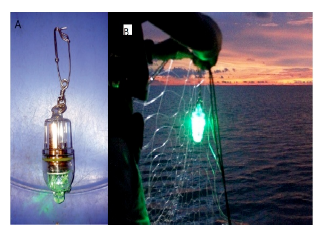
Figure 2. (A) Example of the LED light used during the study. (B) LED fitted on a bottom-set gillnet.

were re-sampled several times using the software RES-AMPLING STATS for Excel (v. 4.0). This analysis measures the strength of evidence against a null hypothesis instead of estimating significance at a certain level.