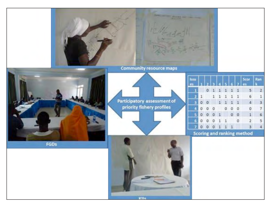
Figure 2. Triangulation between different PRA exercises for the participatory fishery profiling.

These scoring criteria were later used to rank the fisheries and the ranks were compared to see if the fisheries satisfied a specified level of compliance for the composite scoring criteria.