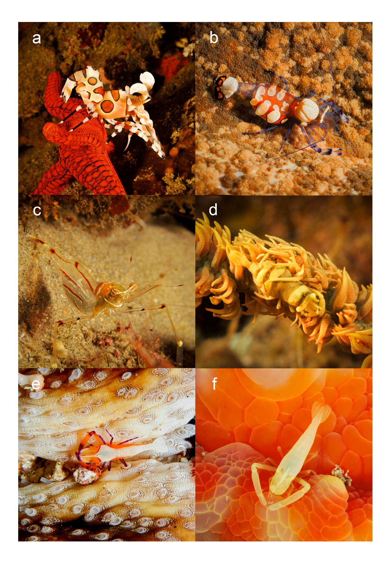
Figure 1. a. Hymenocera picta Dana, 1852 Aliwal Shoal off Scottburgh; b. Ancylocaris brevicarpalis Schenkel, 1902, Sodwana Bay; c. Cuapetes tenuipes (Borradaile, 1898) and d. Pontonides unciger Calman, 1939), both Sodwana Bay, Bikini Reef; e. Zenopontonia rex (Kemp, 1922) and f. colour variant of Z. rex , both Sodwana Bay; photographs all Valda Fraser.