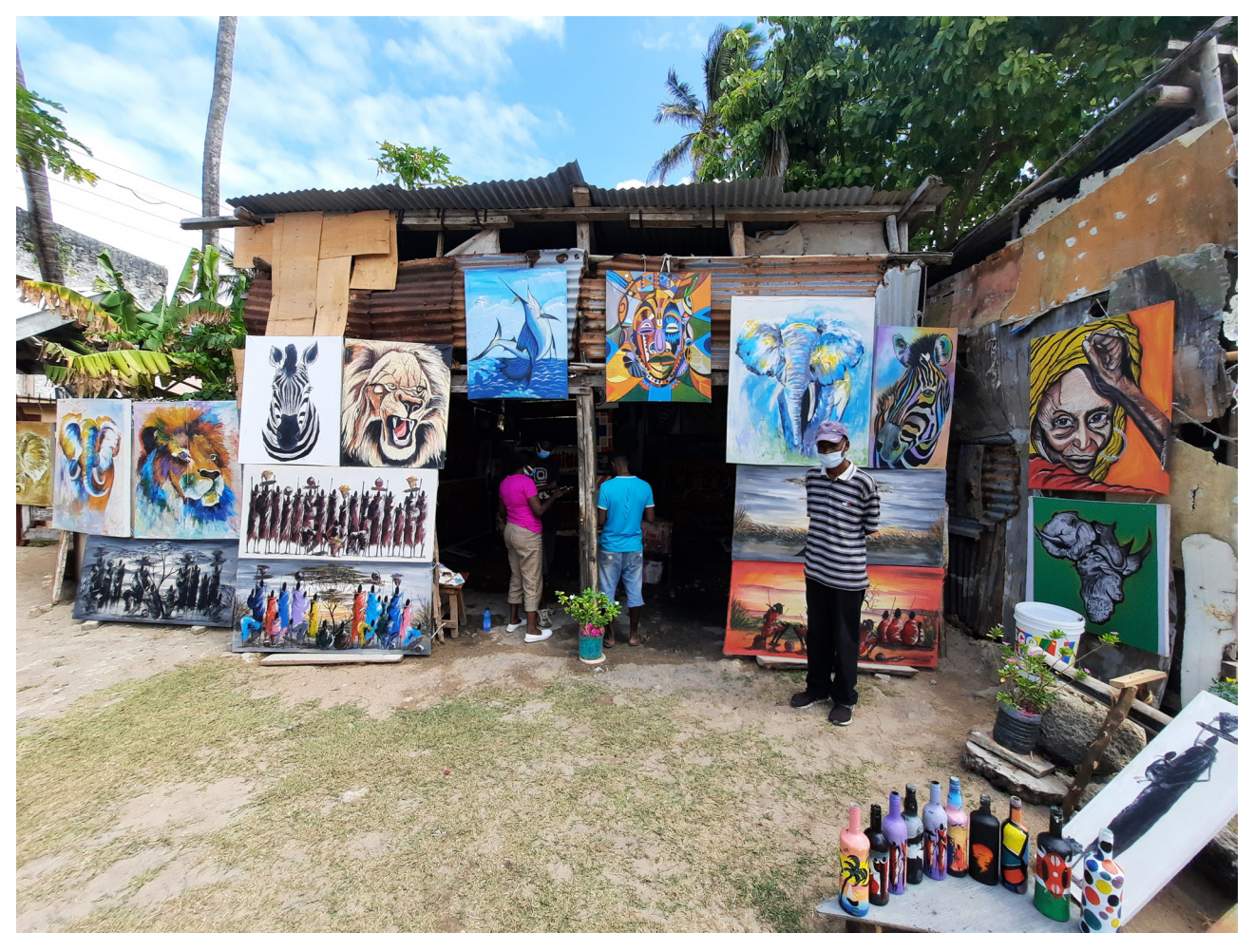
Figure S.1. An artist outside their shop in Kilifi County, Kenya.