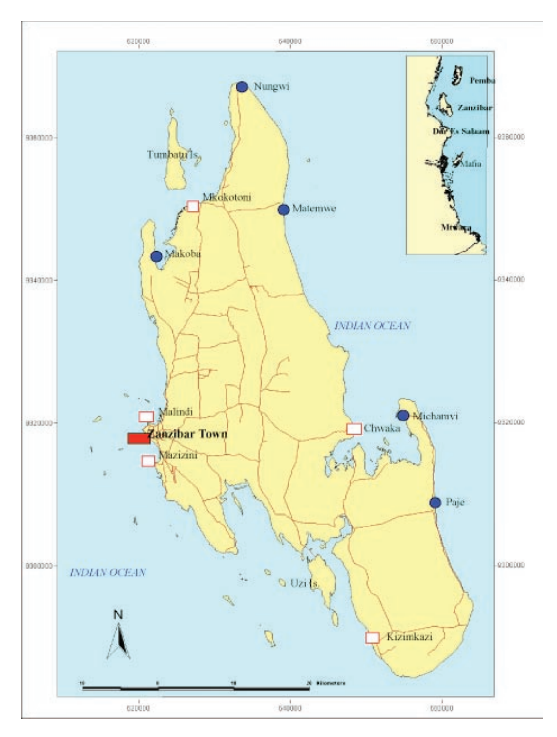
Fig. 1. Locations of sample collection sites and Zanzibar along the Tanzania coast