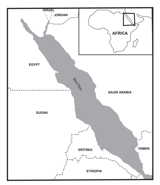
Figure 1. Map of study area showing the Red Sea coasts of Sudan and Eritrea.

used mainly in the production of fish meal for export to Europe and Asia. A small proportion of the catch was also sun-dried for human consumption for markets in Asia (Sanders & Morgan, 1989). Since the main target of this fishery was the export of fish meal, there was a good record of exported quantities, converted to wet weight using a wet weight to processed weight ratio of 4:1 (Ben-Yami, 1964).