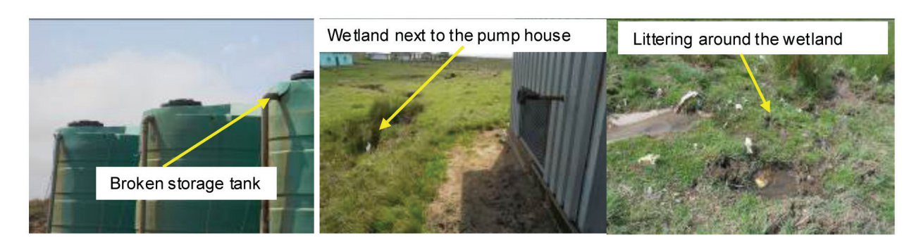
Figure 4 Case Study 1 on-site observation issues noted

Considering the observations from the sites visited in all three provinces, the following recommendations can be made. Source protection (fencing) in some instances may not be effective. Other methods of ensuring safe drinking water should