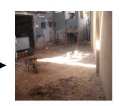
Figure 2 Photographs showing the progress of the company. Left two photographs shows the old state of the company, right photographs shows the old plating area cleaned and floors removed.

ACHIEVEMENT AWARD ETHERWINI WATER AND SAMEATION es the outstanding achie Achievement award DEFY APPLIANCES placed FIRST gory: Large & Medium Enterprises Vater Mediara Environmental Audit of the Mesal Finishing Industry 2072-93