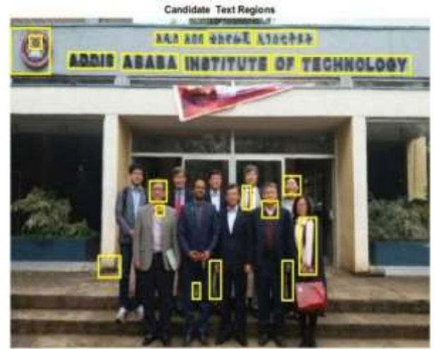
(d) Candidate text regions

(c) After removing non-text regions based on stroke width transform