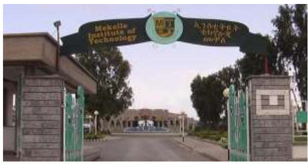
(b) Sample dataset for subjective evaluation Fig 2: A multilingual scene text example.

The performance of our approach was evaluated by measuring its detection rate, based on precision, recall, and F-Measure. The three evaluation values were computed by using equations 3-5, respectively. Precision is defined as the number of true positives (TP) over the number of true positives plus the number of false positives (FP).